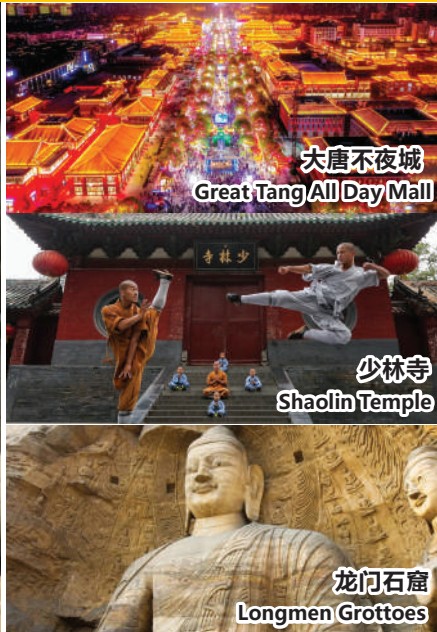
大唐不夜城 Great Tang All Day Mall