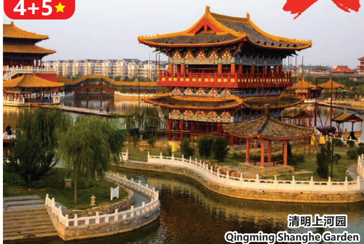
清明上河园 Qingming Shanghe Garden