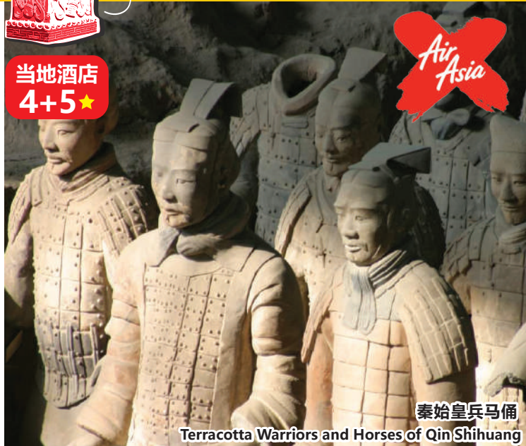
秦始皇兵马俑 Terracotta Warriors and Horses of Qin Shihuang